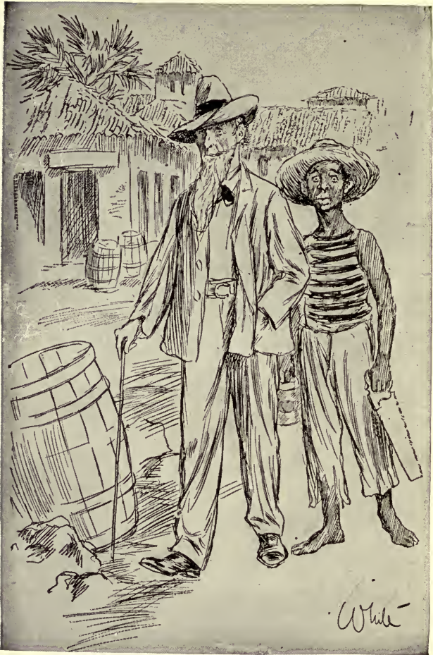
"The old medical outrage . . . had a nigger along."